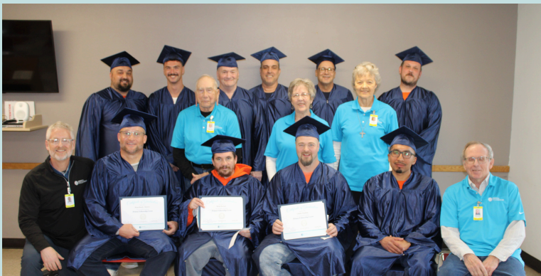
Congratulations to our 1st graduating class of Prison Fellowship Grow at the North Central Correctional Facility

As we celebrate what God has done over this past year, we are filled with hope for what lies ahead. Transformation is happening. Lives are changing. And together, we are witnessing the power of perseverance, accountability, and grace at work. Thank you for being part of this journey with us. We will be starting our 3 rd cohort of Prison Fellowship Grow in May at FDCF and July at NCCF.