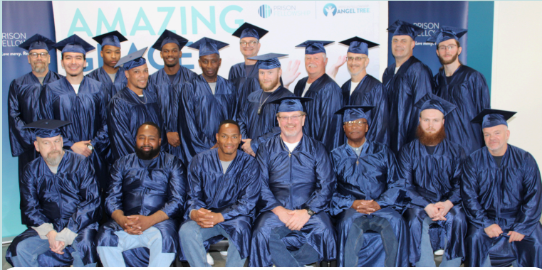
Congratulations to our 2 nd graduating class of Prison Fellowship Grow at the Fort Dodge Correctional Facility

They took greater responsibility for their actions, their attitudes, and their futures. These are not small victories—they are life-shaping changes that ripple far beyond the walls where they began. The graduation ceremony was a moving and unforgettable moment. One by one, the men shared their stories—testimonies of change, humility, and hope. Perhaps most powerful were the ways they spoke about their families. We heard how restored communication, renewed commitment, and healthier choices are already impacting relationships with spouses, children, parents and loved ones.